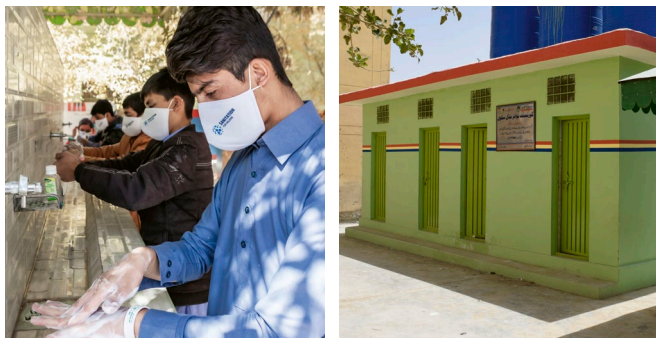
Left to right: Students practising group handwashing with social distancing; The main structure of new toilets and handwashing facility is ready

Sanitation for Millions initiated its interventions in refugee hosting communities in Balochistan in July 2017. The GIZ is leading the programme implementation and cooperates closely with local partners such as the Balochistan Rural Support Programme (BRSP) , Sabawon and with international NGOs such as the Bremen Overseas and Research and Development Association (BORDA e.V.) and German Toilet Organization (GTO) . The programme cooperates at the national level with the Ministry of States and Frontier Regions (SAFRON) , Ministry of Climate Change (MoCC) and at the provincial level with the Department of Education and the Department of Health of the provincial governments of Balochistan and Khyber Pakhtunkhwa.