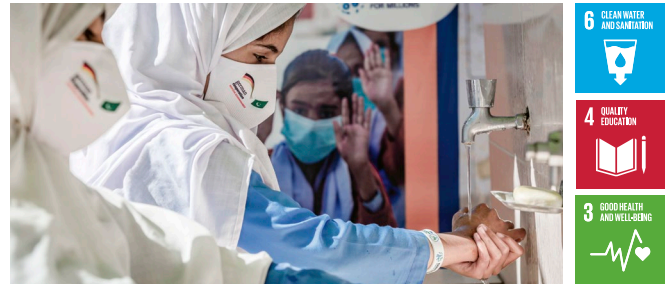
Students washing hands with soap and wearing facemasks at school

The situation is worst in Balochistan and Khyber Pakhtunkhwa, where around 43 % of schools do not have access to safe