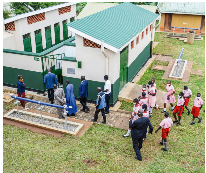
Handover of toilets with handwashing facilities at a school in Uganda

In this context, in 2016, the German Federal Ministry for Economic Cooperation and Development (BMZ) commissioned Sanitation for Millions to improve access to safe sanitation and hygiene with a focus on disadvantaged and vulnerable groups. Since then, around two million people have benefitted directly from the project's measures.