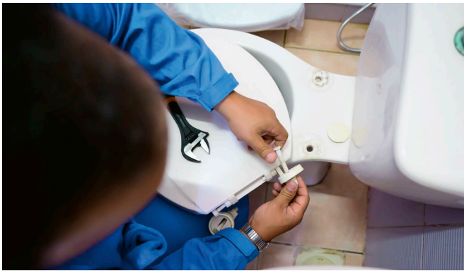
Plumbing training at an orphanage in Jordan