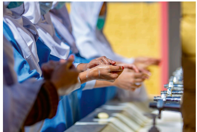
Safe hand hygiene at a school in Pakistan